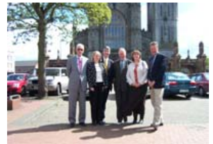
Members of CRGM1 meet with Officials from Louth County Council.

Maintaining close contact with the local communities and further developing and enhancing the relationships that exist between CRGM1 and these groups is seen as crucial to the overall success of the PPP. scheme.